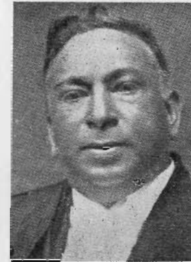
Table tennis. Address: 13 Fenton Road, Salt River, Cape Town; business, 5 Tyne Street, Cape Town.