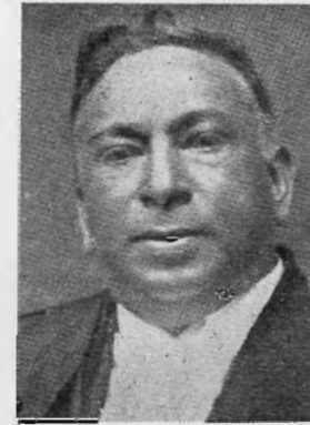
Table tennis. Address: 13 Fenton Road, Salt River, Cape Town; business, 5 Tyne Street, Cape Town.